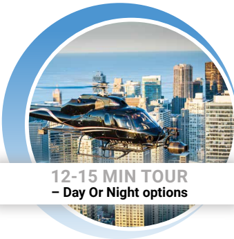
12-15 MIN TOUR – Day Or Night options

$165 / Person (upgrade to private for $369 for up to 2 passengers)