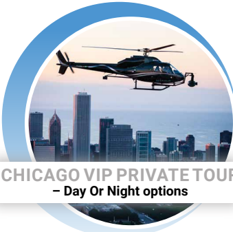
CHICAGO VIP PRIVATE TOUR – Day Or Night options

Call to Book (27-30 min; premium aircraft up to 5 passengers; starting at $1380)